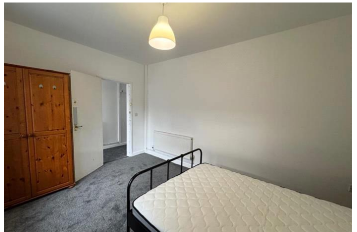
ROOM 1, 4 REES TERRACE, PONTYPRIDD £525 PCM