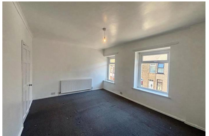
DUNRAVEN STREET, GLYNCORRWG, PORT TALBOT £775 PCM